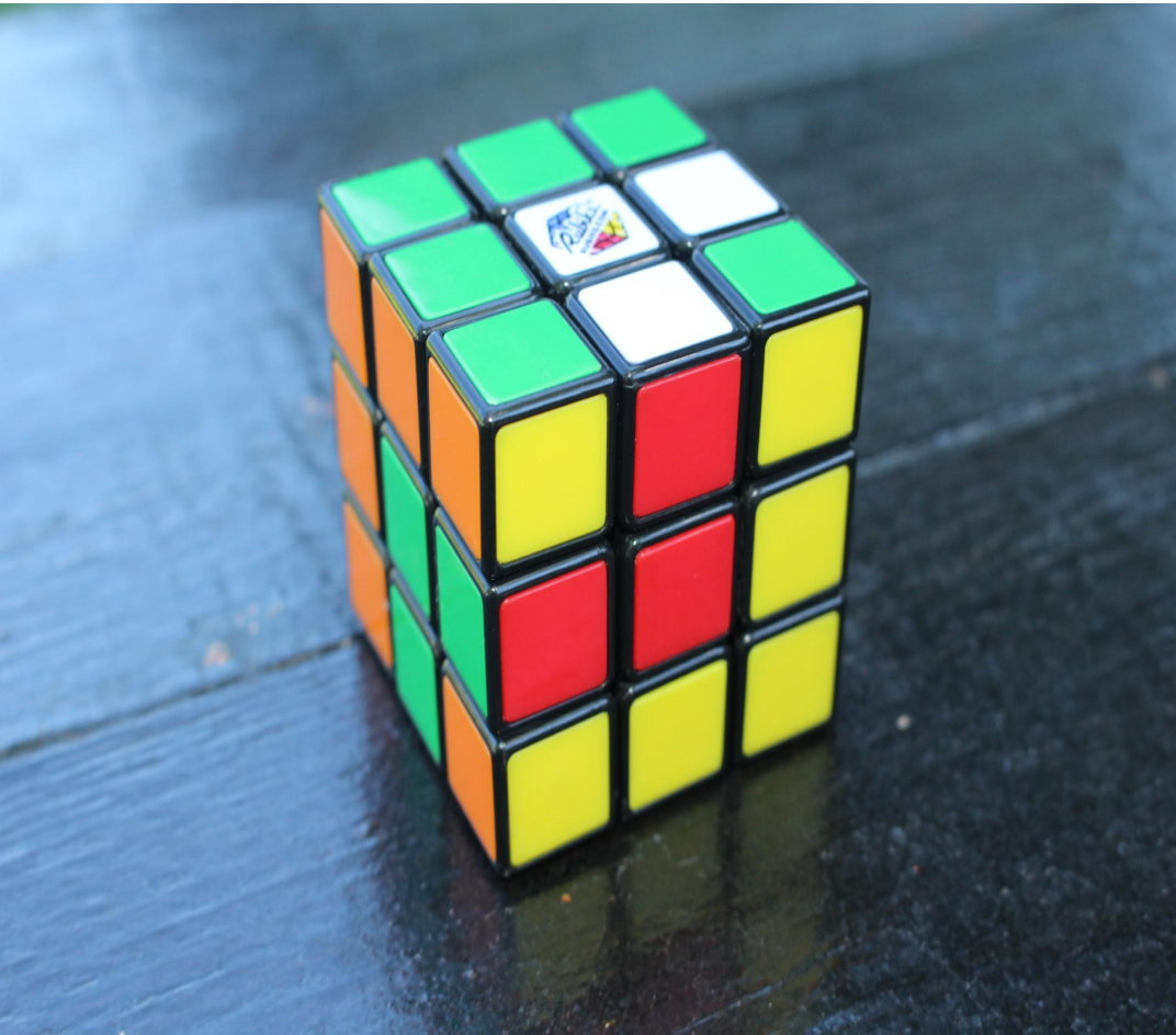
Cool Snake Pattern